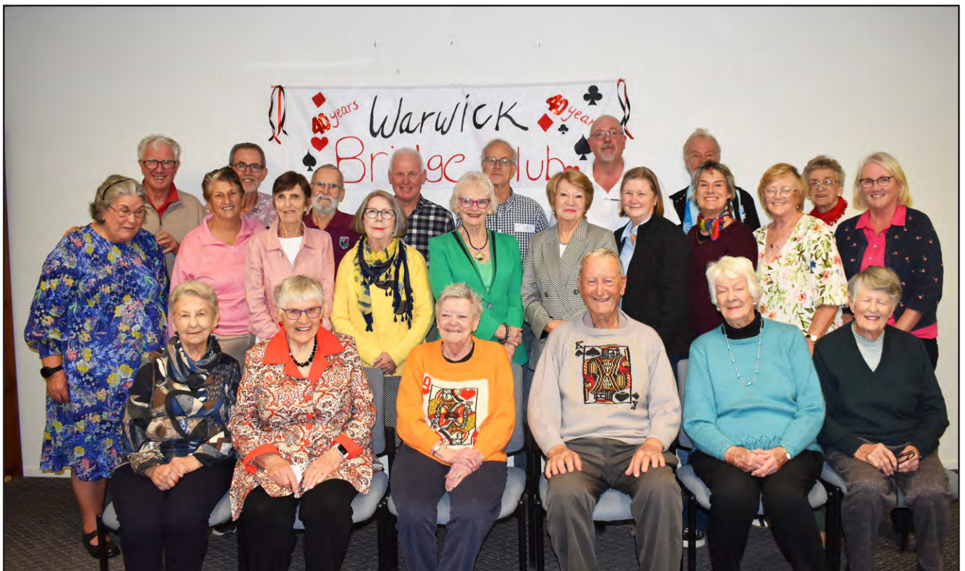
Members present at the anniversary